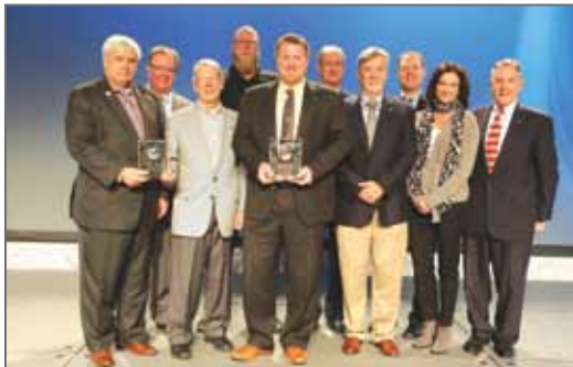
The prestigious President's Award was presented to the E-470 Public Highway Authority.

The IBTTA Toll Excellence Awards recognize toll agencies in the IBTTA membership whose commitment to creativity, innovation, and positive practices represent the best of the industry. The 2013 award winners were recognized at IBTTA's 81st Annual Meeting and Exhibition held in September in Vancouver, British Columbia, Canada.