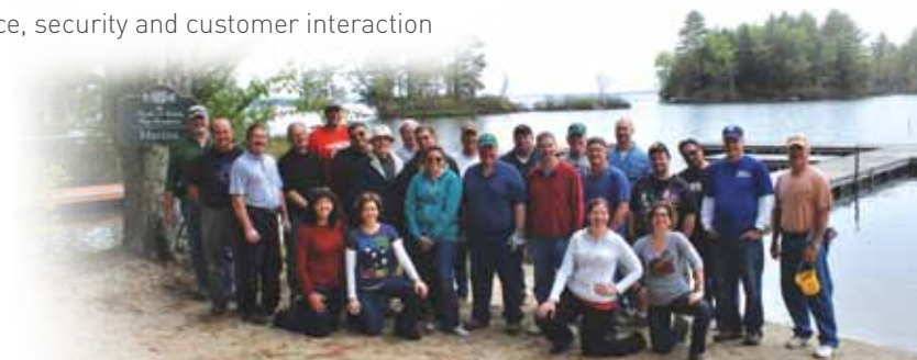
2013 Service Project, Portland, Maine

As the efficient, all-electronic, interoperable toll road of the future continues to evolve; technology is the essential ingredient in delivering service to customers, revenue to highway operators and a viable transportation funding option to governments. Workshop sessions featured the latest intel on current and future technologies for toll collection, operations, maintenance, security and customer interaction in the global tolling market.