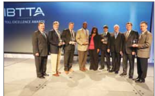
All 2013 Toll Excellence Award Winners.