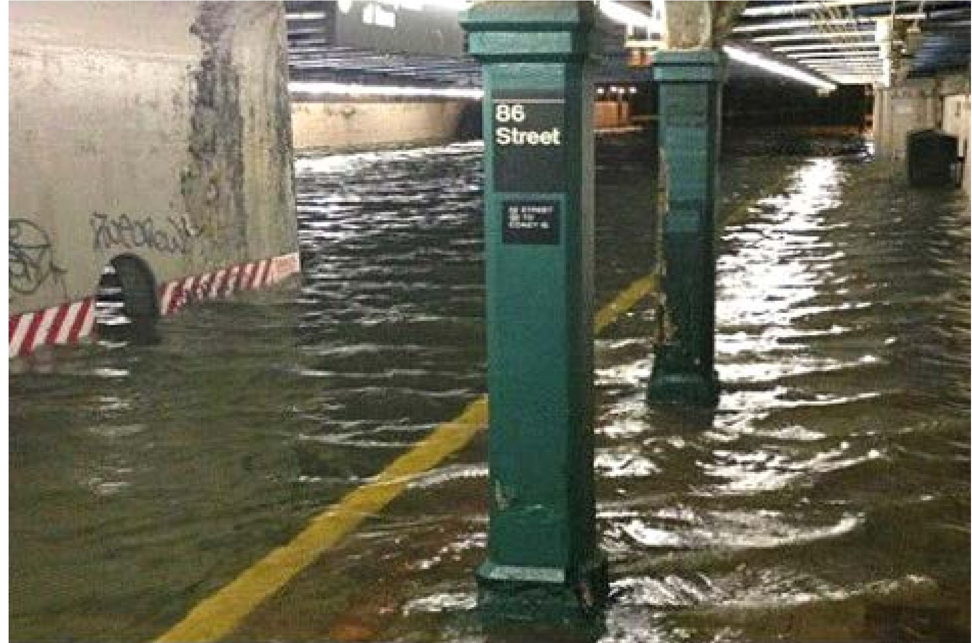
MTA NYC Transit Subway 86 th Street Station