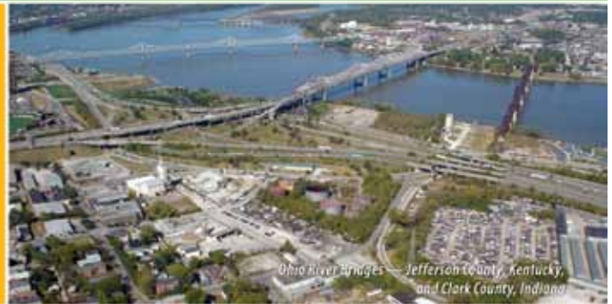
Ohio River Bridges — Jefferson County, Kentucky, and Clark County, Indiana

Trusted provider of tolling solutions for more than 60 years.