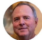
Adam Schiff California