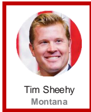
Tim Sheehy Montana