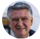
Mark Harris NC-08