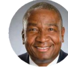
Cleo Fields LA-06