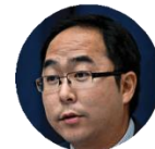
Andy Kim New Jersey