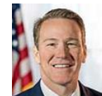
Jon Husted Ohio