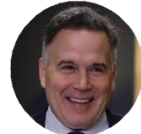
Dave McCormick Pennsylvania