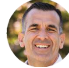
Sam Liccardo CA-16