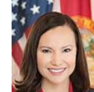
Ashley Moody Florida