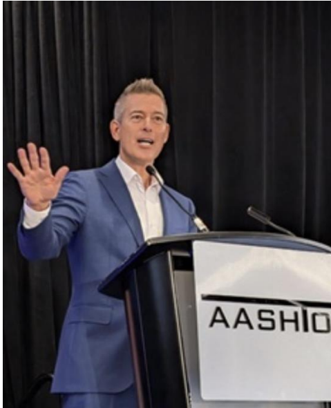
The Honorable Sean Duffy Secretary, USDOT