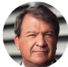
George Latimer NY-16