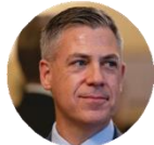
Jim Banks Indiana