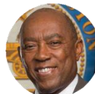
Sylvester Turner TX-18