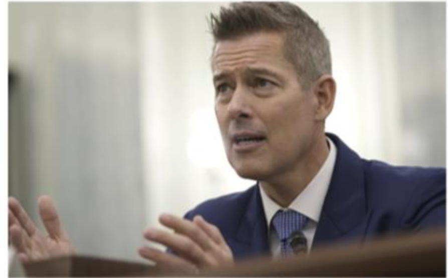
Sean Duffy appearing before the Senate Commerce Committee January 15, 2025

“We could increase tolling or there's a mile driven formula that could be used as well. My concern with that though is the privacy around the American citizens.”