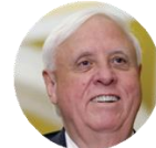
Jim Justice West Virginia