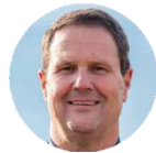
Jeff Crank CO-05