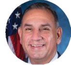
Gil Cisneros CA-31