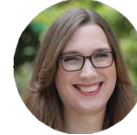
Sarah McBride DE-AL