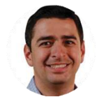
Gabe Evans CO-08