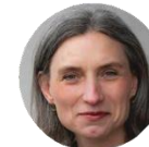
Maxine Dexter OR-03