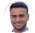
Abraham Hamadeh AZ-08