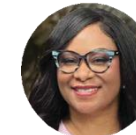
Janelle Bynum OR-05