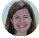
Kristen McDonald Rivet MI-08