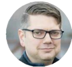
Nick Begich AK-AL