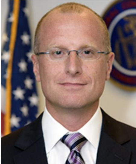
Brendon Carr , Chairman, Federal Communications Commission (FCC)