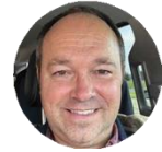
Marlin Stutzman IN-03