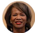
Lisa Blunt Rochester Delaware