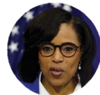
Angela Alsobrooks Maryland