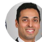
Suhas Subramanyam VA-10