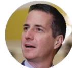
Bernie Moreno Ohio