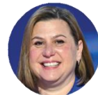
Elissa Slotkin Michigan