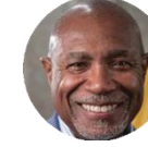
Herb Conaway, Jr. NJ-03