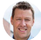
Josh Riley NY-19