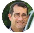
Derek Schmidt KS-02