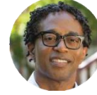
Wesley Bell MO-01