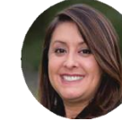
Luz Rivas CA-29