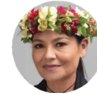
Kimberlyn King-Hinds MP-AL